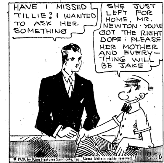
© 1928, by King Features Syndicate, Inc. Great Britain rights reserved.